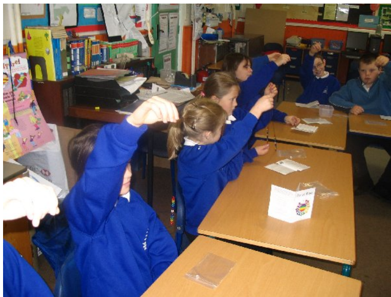
Cadwyni Mala Heddwch/ Peace Mala Beads

Collective Worship at Ysgol Clocaenog takes place five days a week and is broadly Christian. The school has no affiliations with a particular religion or religious denomination. Parents have the right to withdraw their child from all or part of the Religious Education and Collective Worship provided. These children will be supervised by a member of staff for the duration.