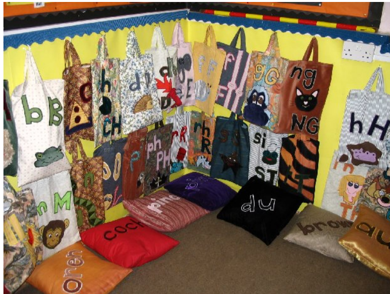
Bagiau llyfrau stori – wedi eu gwneud gan riant/Story book bags – prepared by a parent

Assessment is a continuous process. Teacher assessment of a child's present stage of development, and consequent needs, takes place for all subjects of the curriculum during the normal work of the school day. Each child is assessed on entrance to the Nursery class and during the first few weeks in Reception the children will be involved in a baseline assessment. The outcomes of these assessments will be shared with parents during our autumn parent's evenings. Parents' Evenings are held twice a year and a written report is sent to parents in July.