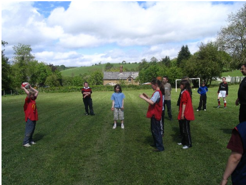
Hyfforddiant rygbi ar gae'r ysgol/Rugby training on the school's field

The school's programme of sex education, as agreed by the Governing Body, is linked with the Personal and Social Education Framework published in 2001. Sex education is one part of the framework and the BBC programme "Health e" is used as a guide to teaching. Each query or comment on this subject is dealt with on an individual basis as it arises. Parents will be consulted if issues arise that cause concern. The school Sex Education Policy is available on request.