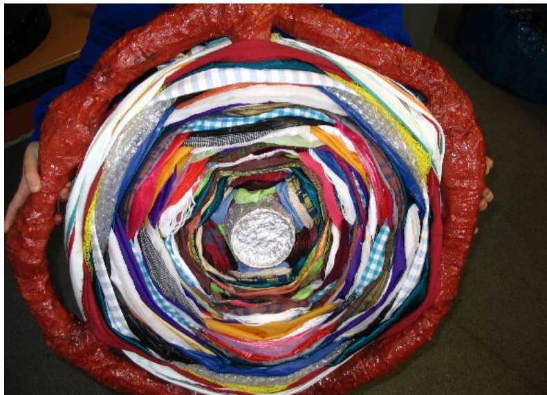
Cynnyrch y Clwb Crefft/ A product of the After School Craft Club

A club is held for Key Stage 2 pupils after school on Mondays. The activities vary according to the time of year e.g. Art, Craft, Computers or Games. All pupils are encouraged to become members of the Urdd (Welsh League of Youth).