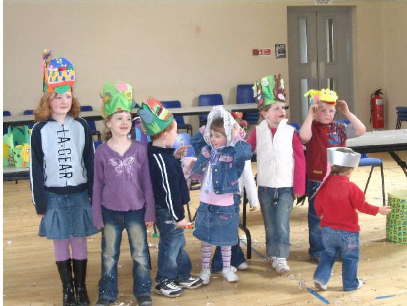
Palnt yn gwisgo eu hetiau Pasg/ Children wearing their Easter hats